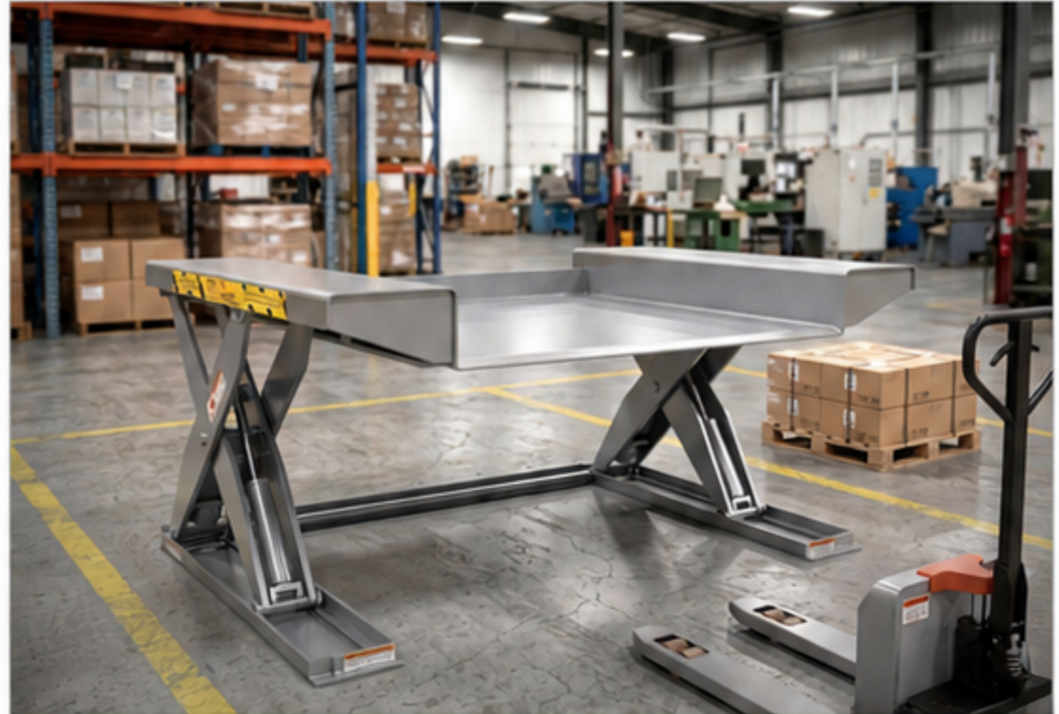
WAREHOUSE & MANUFACTURING USE