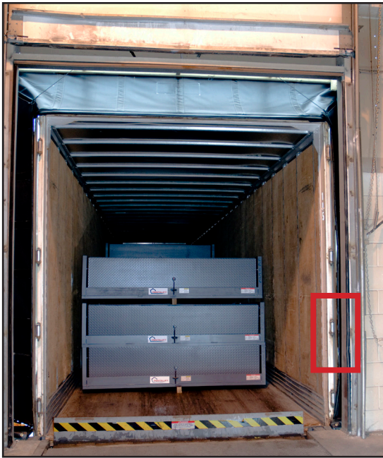
Full Access to Trailer Door Opening