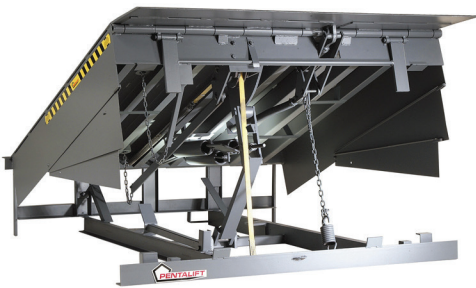
Pentalift Mechanical Dock Levelers

Pentalift mechanical dock levelers are designed to meet the needs of today's loading docks. They are semi-automatic and require no manual lifting. A simple pull chain, positioned at the rear of the deck, engages and releases the dock. The patented easy float hold down and posilock lip operator make this the safest mechanical leveler available. The easy float brake band lets the deck assembly float with the trailer while in use. Use the following link to go to the dock leveler page on the internet. www.pentalift.com/dock-levelers.htm