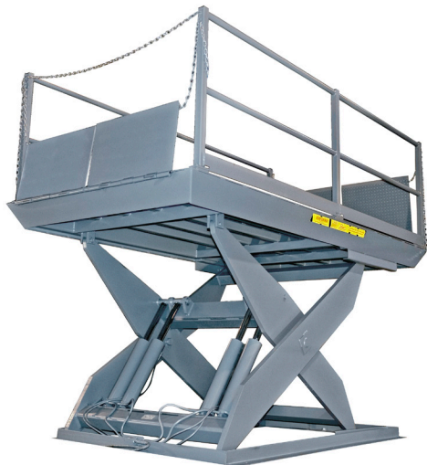
HED Series Pit Mounted Dock Lift

Dock lifts are an excellent means of simplifying loading functions and creating safer working conditions where loading docks don't exist or in conjunction with dock levelers to provide greater flexibility for a busy loading dock. Pentalift pit-mounted and low-profile surface mounted dock lifts provide an increased service range eliminating the potential for unsafe loading operations due to severe height differences between ground level and the truck's trailer bed. Safer and more efficient than loading by ramp or by hand. Use the following link to go to the dock lift page on the internet. www.pentalift.com/elevating-docks.htm