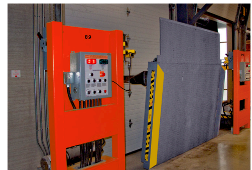
Pentalift Vertical Storing Dock Levelers

Pentalift offers hydraulically operated vertical storing dock levelers when safety, cleanliness, security, and energy savings are required in one design. This style of leveler is ideally suited for cold storage, food processing and pharmaceutical operations. Featuring a powered up and down hydraulic system which stores in a safe, over centered position. Use the following link to go to the dock leveler page on the internet. www.pentalift.com/dock-levelers.htm