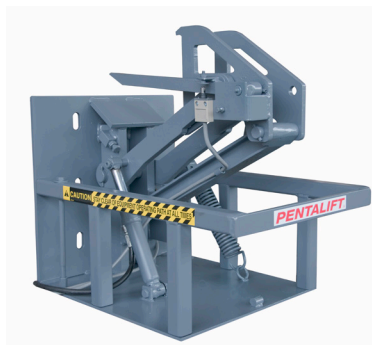
HFR32 Vehicle Restraint System