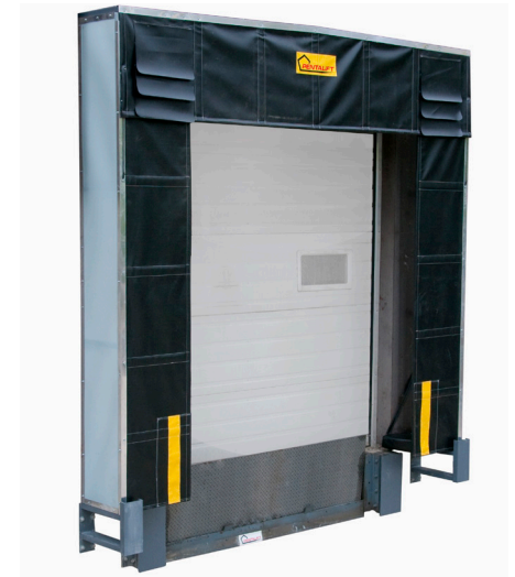
PS-400 Dock Shelter