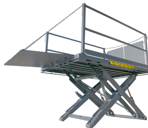
LPE Series Surface Mounted Dock Lift