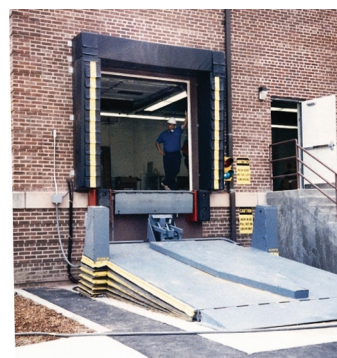
Pentalift Truck Levelers

Pentalift also provides a wide variety of other equipment to create an efficient, secure and safe loading dock environment including truck levelers, safety barriers, wheel chocks, dock lights and dock bumpers making Pentalift your ideal single-source loading dock supplier with solutions to improve safety at your loading docks.