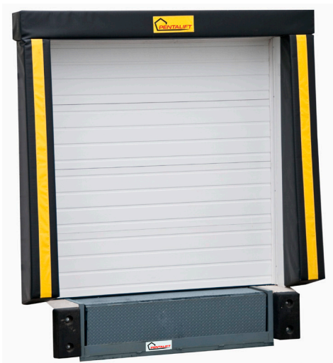
PS-100 Dock Seal

Pentalift manufactures a complete range of foam and air inflatable dock seals as well as rigid, flexible and air inflatable dock shelters. All products are designed to improve safety, protect merchandise, reduce energy cost and improve security at the loading dock. The wide range of fabric materials, configurations and options allow you to build the best solution for your application. Use the following link to go to the dock seal and shelter page on the internet. www.pentalift.com/dock-seals-dock-shelters.htm