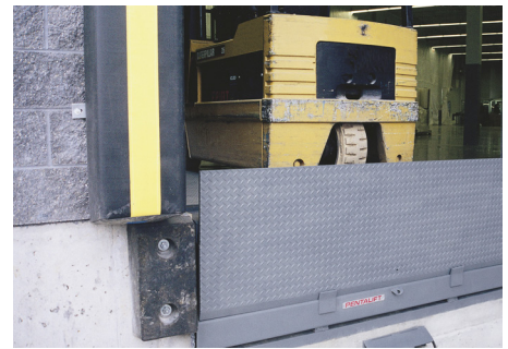
Pentalift Roll-Off Stop Lip Design