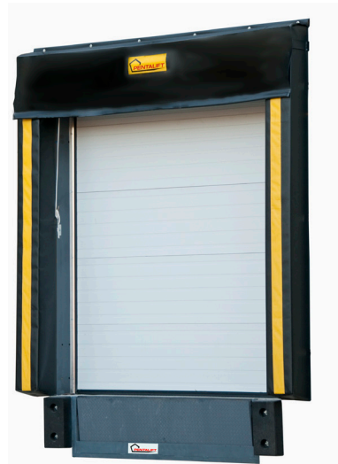
PS-200 Dock Seal