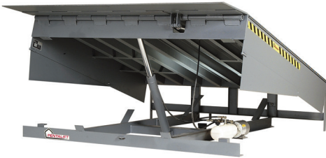
Pentalift Hydraulic Dock Levelers

Pentalift hydraulic dock levelers provide superior value through prolonged, trouble-free performance. They are designed to provide the highest level of safety through automatic push button operation. The Pentalogic hydraulic manifold revolutionized hydraulic control circuitry by eliminating multiple valve assemblies, which can cause on-site adjustments, oil leaks, and hydraulic component failure. Pentalift dock levelers are designed to provide reliability, safety and performance. Use the following link to go to the dock leveler page on the internet. www.pentalift.com/dock-levelers.htm