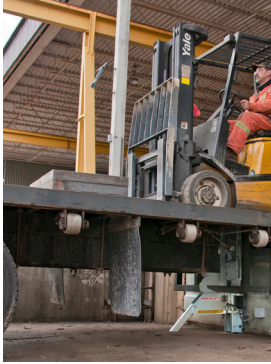
RVR32 Vehicle Restraint System

Pentalift offers a wide range of mechanical and automatic vehicle restraint systems designed to improve safety and prevent accidents at the loading docks. The cost of an industrial accident at the loading dock can easily exceed $1,000,000 and result in increased insurance cost. A range of models allow you to select the proper solution for your application. All models have light and sign systems available to improve the communication between the dock attendant and the driver. All safety conscious facilities should incorporate vehicle restraints. Use the following link to go to the vehicle restraint page on the internet. www.pentalift.com/vehicle-restraints.htm