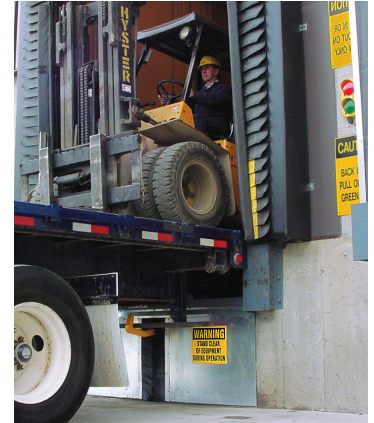
UHR40 Hydraulic Vehicle Restraints