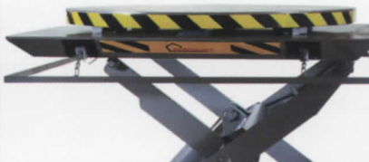
Table top rotates, manually or powered, to enable work to be positioned, minimizing worker reaching, stretching and straining. Spring actuated detent stops are available to locate the platform in 90 degree increments. Various brake systems (manual or powered) are available to stop/lock in any position.