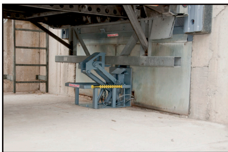
HFR32 Vehicle Restraint