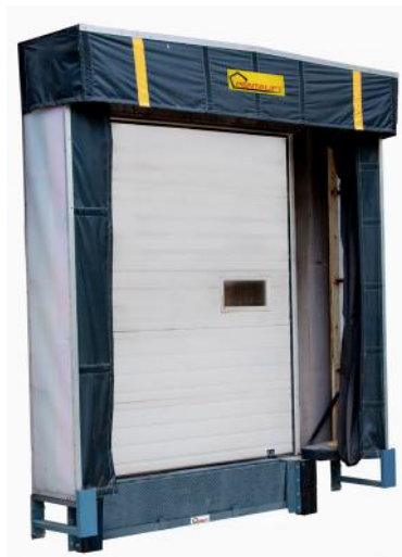
PSI-450 Inflatable Dock Shelter