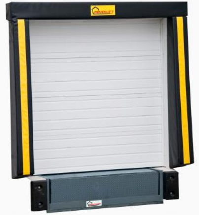
PS-100 Dock Seal