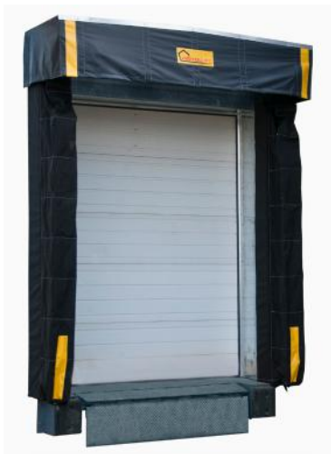
PSI-350 Inflatable Dock Seal