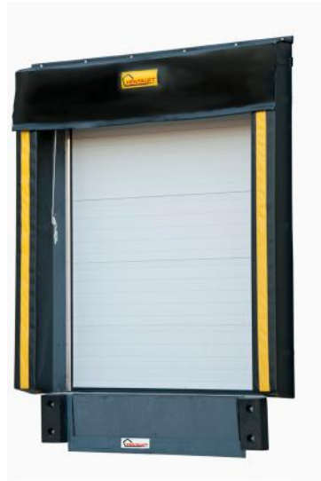
PS-200 Dock Seal