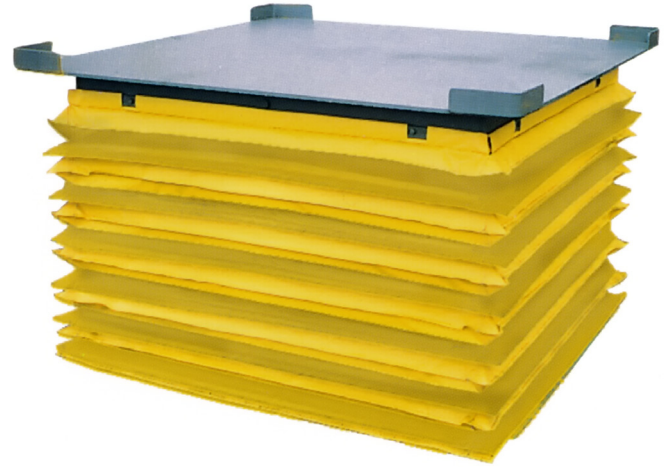
Accordion bellows: Minimize debris entry