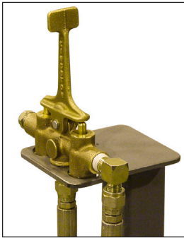
Control valve: c/w muffer on pedestal (standard)

Pentalift Equipment Corporation manufactures the highest quality lifting and positioning equipment in the industry. The Pentalift ProAir line of pneumatic lift, rotate and tilt tables help to create a safe and efficient workplace which increases productivity and reduces the potential of cumulative trauma disorders. Pentalift ProAir pneumatic lifts are easy to install. The complete line of equipment operates utilizing the facilities air supply. The heavy duty construction of the lift tables is consistent with the reputation that Pentalift has earned for high quality designs and durability through out its full line of lift and positioning equipment. Built to last.