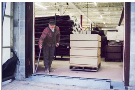
Torsion spring assist and integrated handle result in low effort activation.