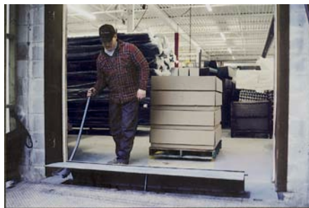
The edge of dock lip automatically locks as the deck is extended.