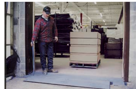
Safety is enhanced through less operational effort. Increased convenience and safer than aluminum dock plates.